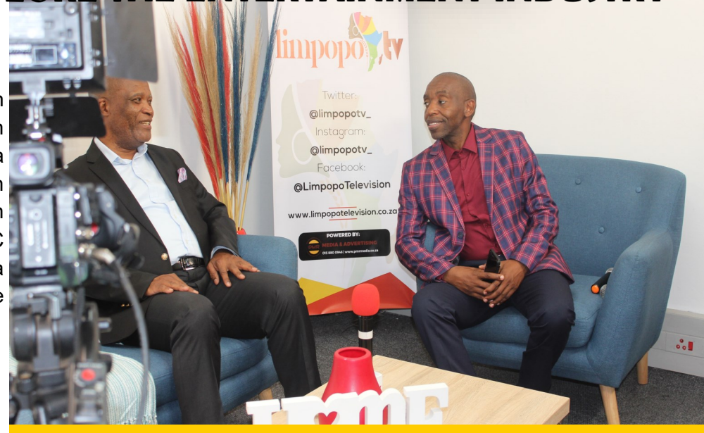
MEC Masemola with Limpopo TV presenter during an interview at the

The heartland of southern Africa - development is about people!