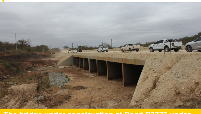
The bridge under construction at Road D3727 under Thoyhele Mulima

It is the intention of the MEC to work with all stakeholders to resolve the enormous road infrastructure backlog and challenges, amidst the budget constraints faced by the Province.